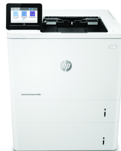
HP LaserJet Enterprise M609x