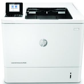
HP LaserJet Enterprise M609dn

This HP LaserJet Printer with JetIntelligence combines exceptional performance and energy efficiency with professional-quality documents right when you need them – all while protecting your network from attacks with the HP's deepest security 1