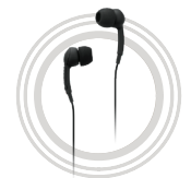
Lenovo 100 In-Ear Headphone