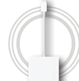
Lenovo USB-C 3-in-1 Hub