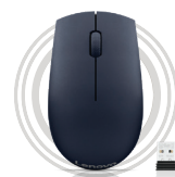
Lenovo 520 Wireless Mouse