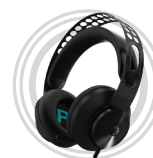
Legion H300 Stereo Gaming Headset