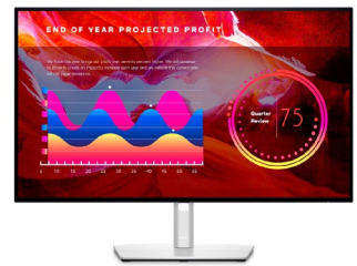
Dell UltraSharp 27 Monitor - U2722D

World's slimmest and lightest soundbar offers exceptional audio clarity and easy magnetic attachment to your Dell monitors, ensuring a clutter-free desk.