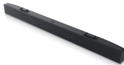
Dell Slim Soundbar - SB521A

An immersive 34" WQHD curved monitor with wide color coverage and extensive connectivity including RJ45, USB-C® and quick-access front ports.