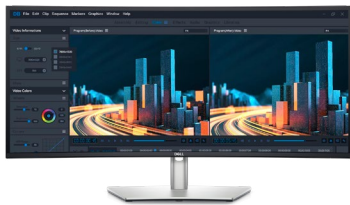
Dell UltraSharp 34 Curved USB-C HUB Monitor - U3421WE

An immersive 34" WQHD curved monitor with wide color coverage and extensive connectivity including RJ45, USB-C® and quick-access front ports.