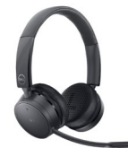
Dell Pro Wireless Headset - WL5022

Elevate your video conferencing experience with this high quality 4K webcam that optimizes your visuals with a large 4K Sony STARVIS™ CMOS sensor and AI Auto-Framing.